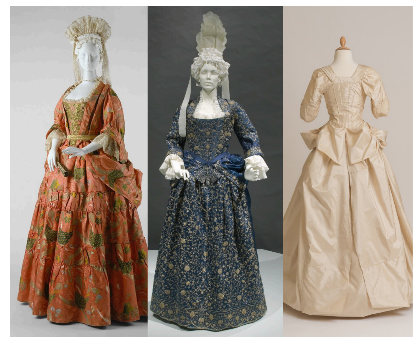
Detailed mantuas, petticoats, stomachers, etc. for high society