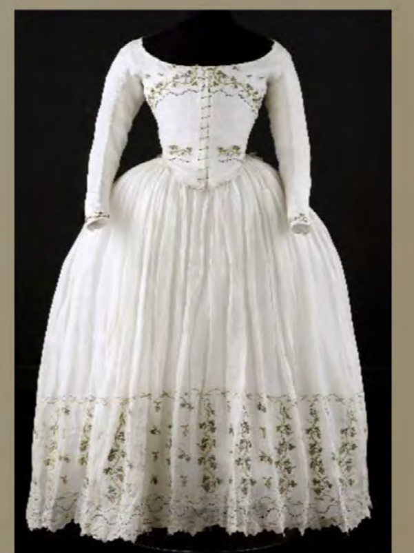
Caraco and Petticoat ca. 1789