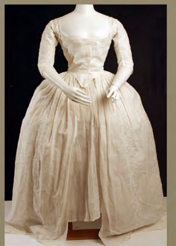
Robe à l'anglaise ca. 1780