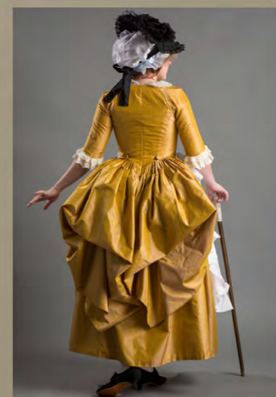
The Robe à la Turque The Gown - American Duchess Blog