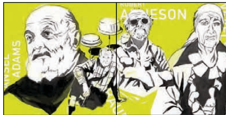
● WEST ELEVATION Close-up