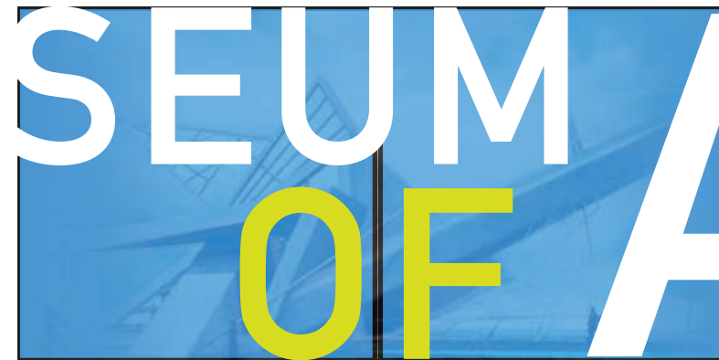
● NORTH ELEVATION Close-up