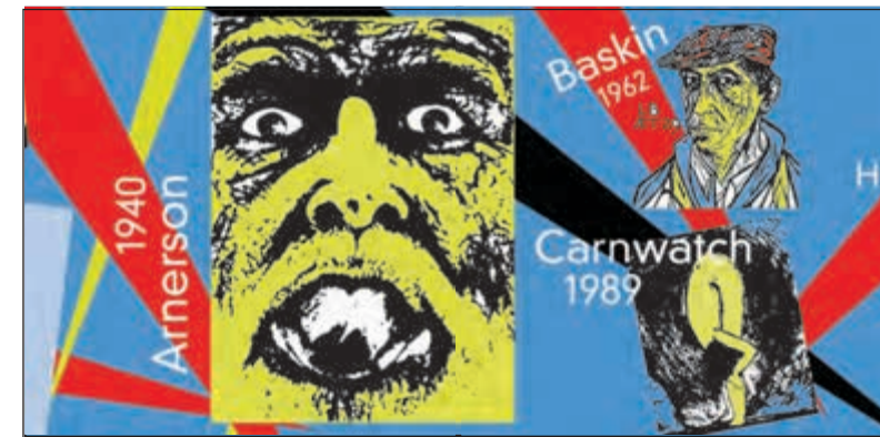
● EAST ELEVATION Close-up