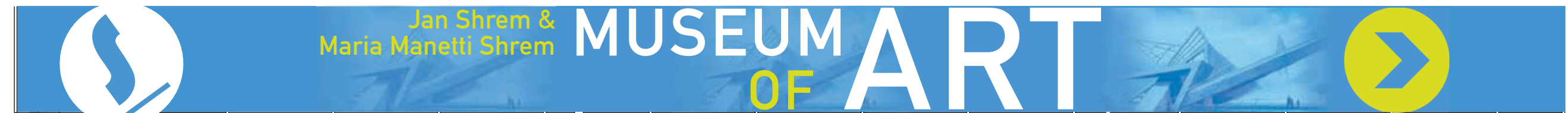
● NORTH ELEVATION